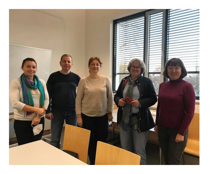
Kick-off meeting of the working group