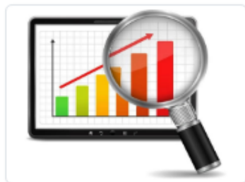
Індивідуальний моніторинг лист