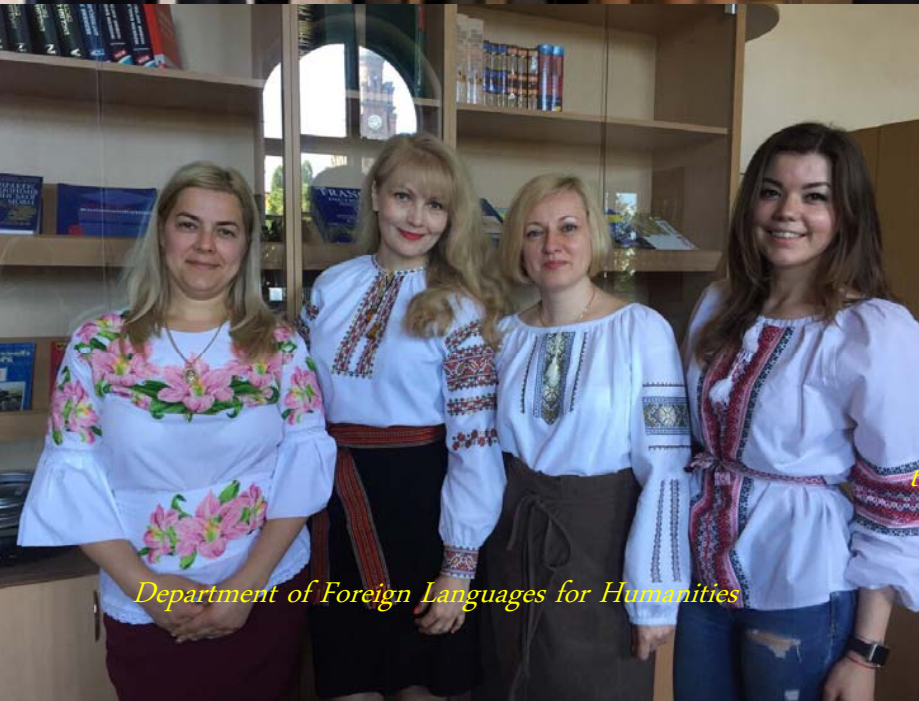
Department of Foreign Languages for Humanities