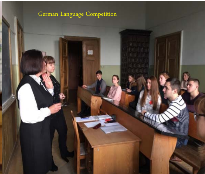
German Language Competition