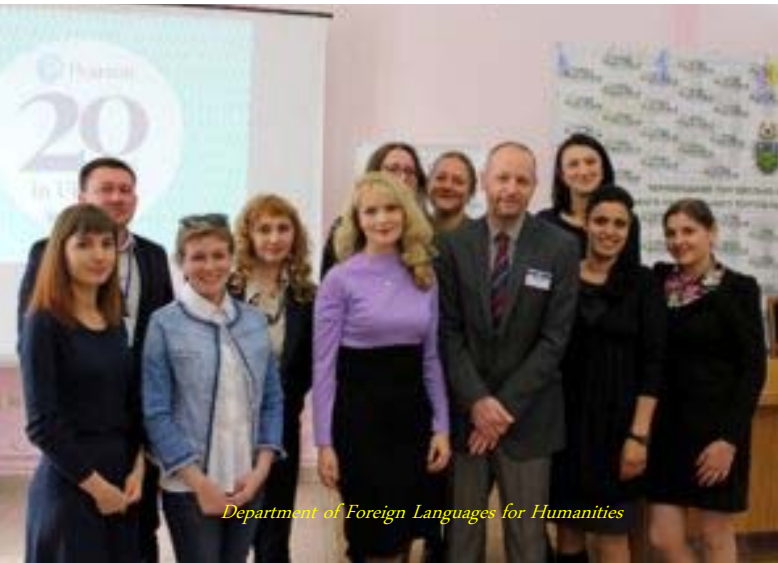
Department of Foreign Languages for Humanities