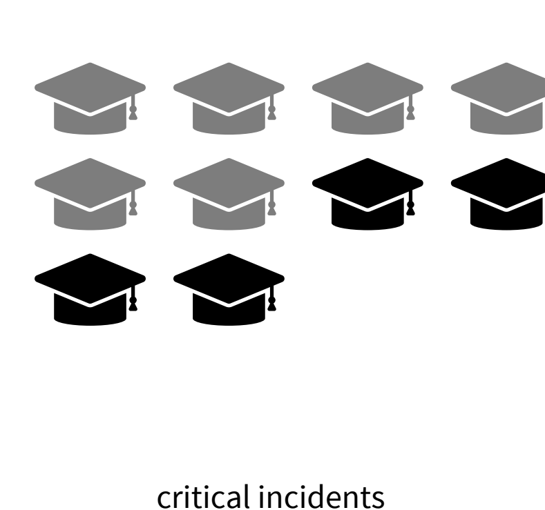
Figure 2 Examination of influencing factors of autonomy in decision making and credibility in public (symbolic image)