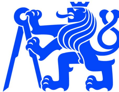
Czech Technical University in Prague Faculty of Mechanical Engineering