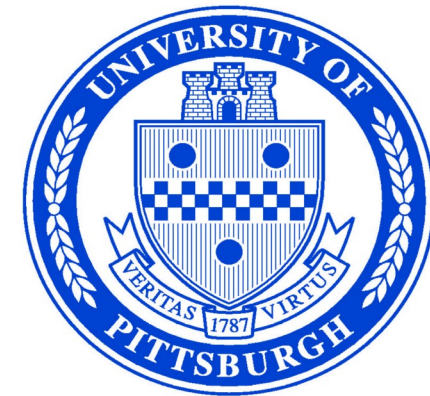
University of Pittsburgh Swanson School of Engineering

In association with the Nečas Center for Mathematical Modeling